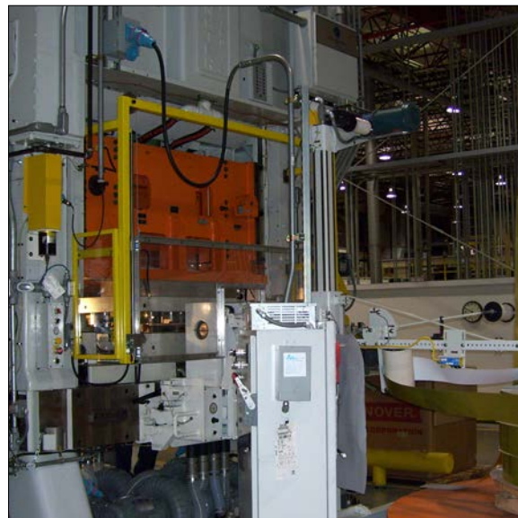
Power to the uncoiler in front of this Stolle Cupping System can be disconnected easily for die changing or maintenance, using the MELTRIC Switch-Rated connector visible above the die on the left side of the machine.

Stolle uses the Switch-Rated devices to make electrical connections on a variety of equipment. Harmon says one typical application is on a cupping machine, which makes the bottom section that later gets formed into the body of the can. "It's actually on a blower motor for the machine's pneumatic conveying system," he explains. "We also use them on blowers for our end machines and on our uncoilers." He notes that these types of equipment