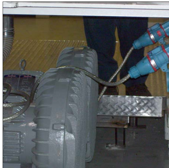
Blower motor for pneumatic conveying system on this Stolle End Machine can be disconnected and moved quickly with the Switch-Rated plugs and receptacles, shown at right.